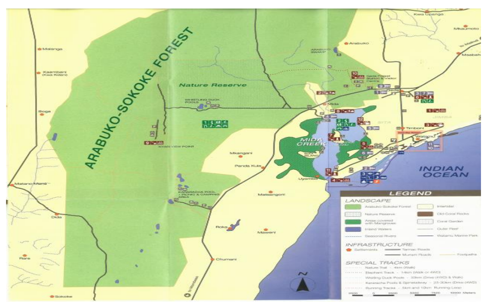
Figure 1.1: Map of the Study Area

The forest is an ideal habitat for the promotion of avitourism activities because of its' mixed forest nature that host diversity of bird-life (KWS, 2014). The dry land endemic forest habitat is managed by Kenya Wildlife Service while the marine habitat and the waters that end up in a mangrove forest under the management of Kenya Forest Service (KFS). This marine habitat which is composed of mangrove forest, the beaches and creek are ideal stopover and feeding ground for migratory bird species.